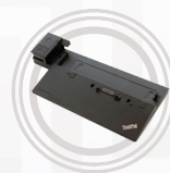
ThinkPad Ultra Dock

Lenovo reserves the right to alter product offerings and specifications at any time, without notice. Lenovo makes every effort to ensure accuracy of all information but is not liable or responsible for any editorial, photographic or typographic errors. All images are for illustration purposes only. For full Lenovo product, service and warranty specifications visit www.lenovo.com . Lenovo makes no representations or warranties regarding third party products or services. Trademarks: The following are trademarks or registered trademarks of Lenovo: Lenovo, the Lenovo logo, ideapad, ideacentre, yoga and yoga home. Microsoft, Windows and Vista are registered trademarks of Microsoft Corporation. AMD, the AMD Arrow logo and combinations thereof are trademarks of Advanced Micro Devices, Inc. in the United States and/or other jurisdictions. Other company, product and service names may be trademarks or service marks of others. Battery life (and recharge times) will vary based on many factors including system settings and usage. Visit www.lenovo.com/lenovo/us/en/safecomp/ periodically for the latest information on safe and effective computing. ©2016 Lenovo. All rights reserved.