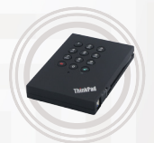
ThinkPad USB 3.0 Secure Hard Drive