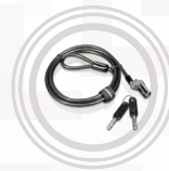
Microsaver DS Cable Lock