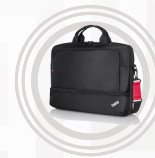
ThinkPad Essential Topload